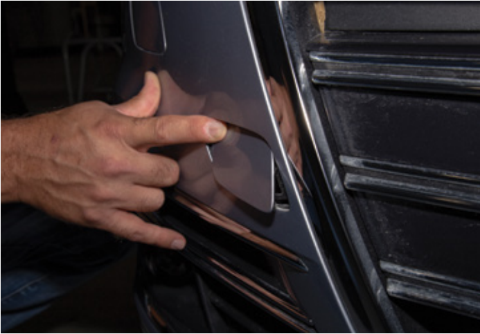
FRONT: Press the top of the front eyelet cover to remove.