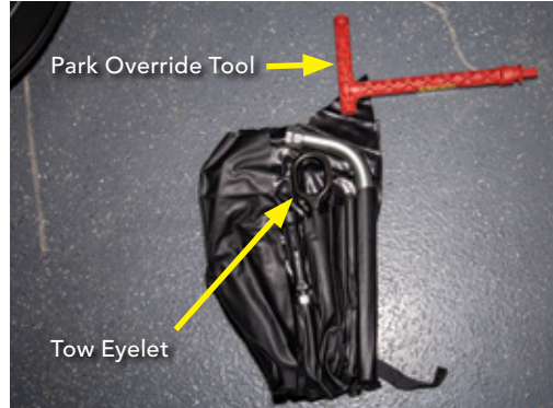
Tool Kit and Park Override Tool